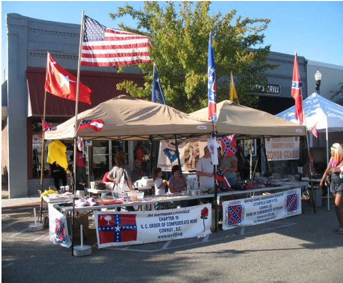
Set up and ready to sell !