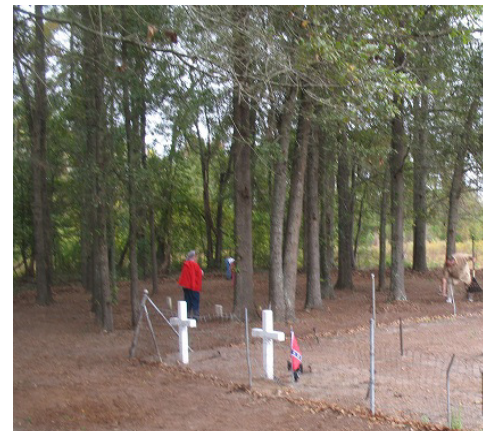
When we finished