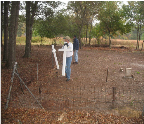
Crosses being placed