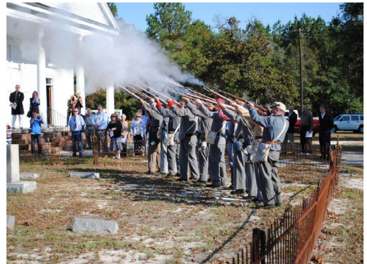
The Waccamaw Light Artillery and Stafford Militia