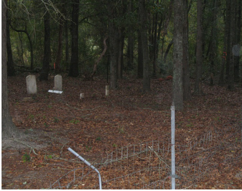
Before we started.