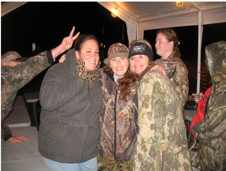
Just Clowning around