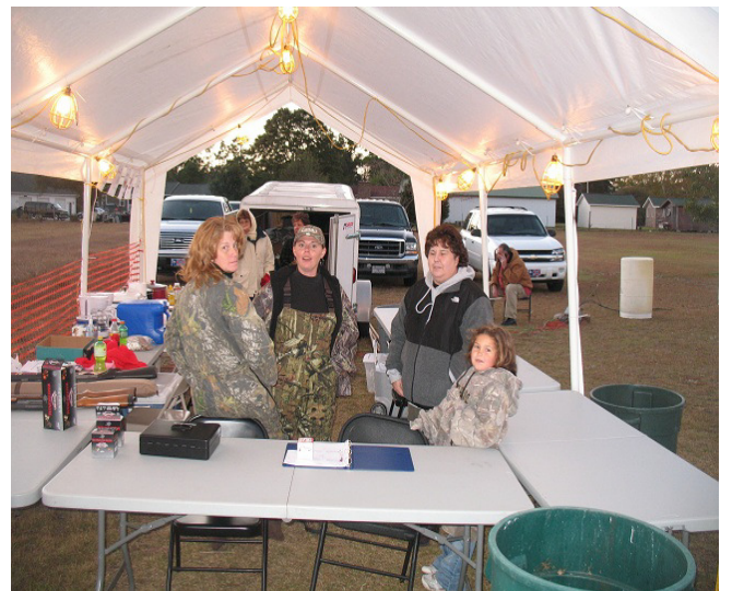
Our OCR set up and ready