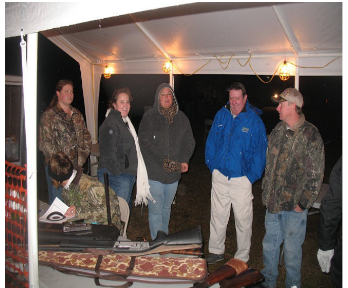
It was a Kodak moment