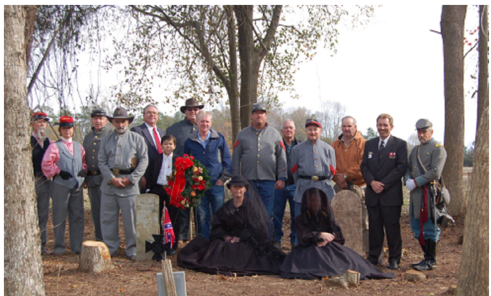
Litchfield Camp 0132, Ida M. Litchfield Chapter 19 and The Waccamaw Light Artillery