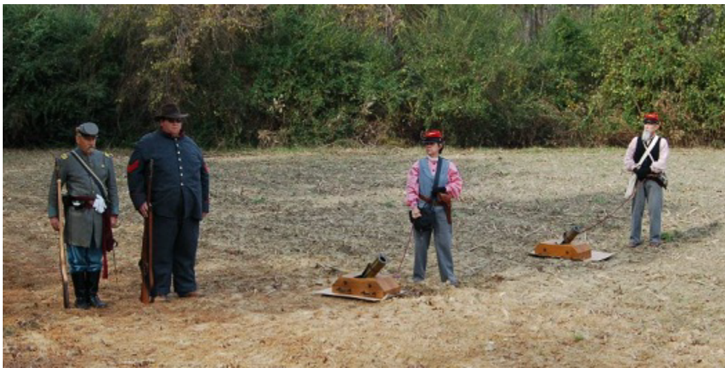
Waccamaw Light Artillery