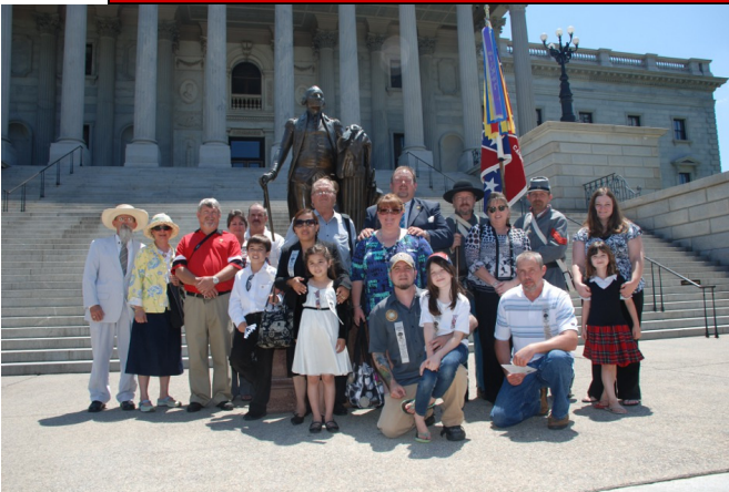
Litchfield 132 garners much family support.

Confederate Memorial Day Columbia, SC May 7, 2011