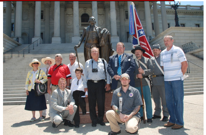
10 Compatriots and 1 Cadet attended the Confederate Memorial Day Service in Columbia