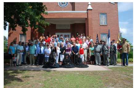
70 of the 130 attendees pause for a photo op