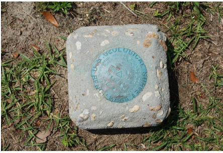
At 176 feet above sea level... the highest point in Horry County